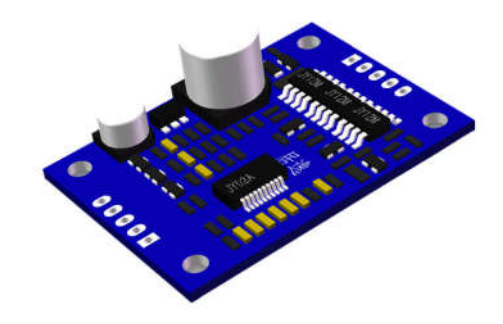
Driver board diagram